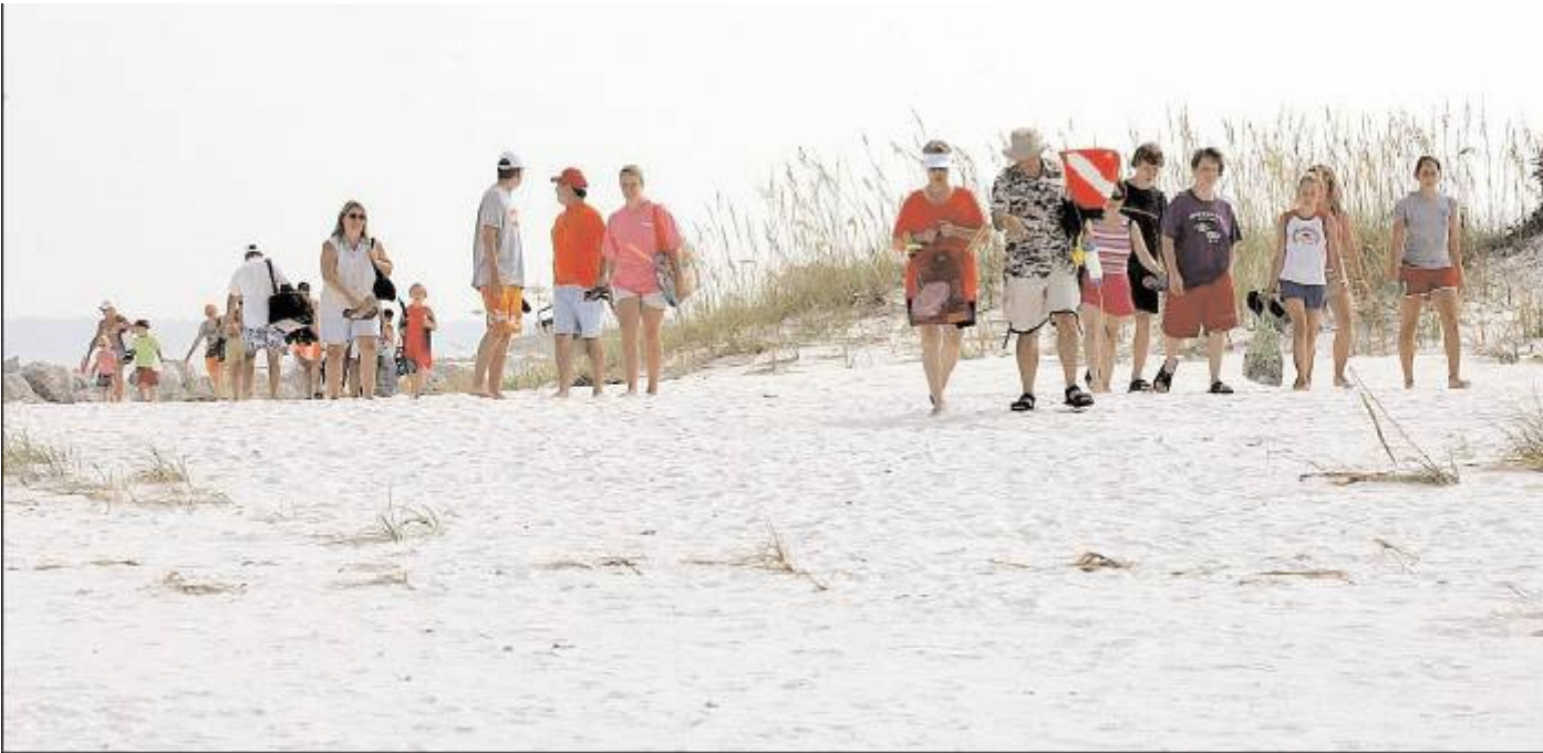
Shell Island has become very popular with tourists who visit in throngs every day. Law enforcement is trying to minimize the impact to the island — not by limiting people, but by banning dogs on the island.